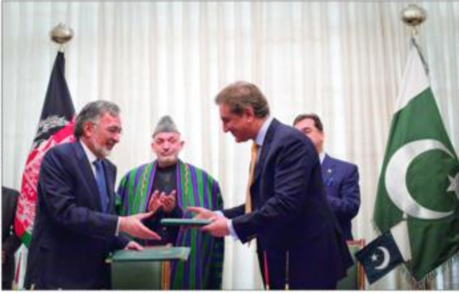
ISLAMABAD: Foreign Minister Shah Mehmood Qureshi (2nd R) and his Afghan counterpart Zalmay Rassoul exchange signed agreements between the two countries at the Prime Minister's residence here on Thursday.